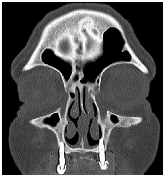
Fig 1 Implant protruding into the sinus.